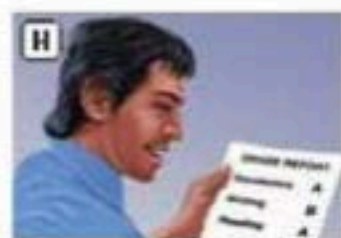
H. Get good grades.