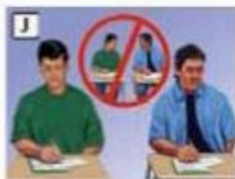
J. Work on your own.