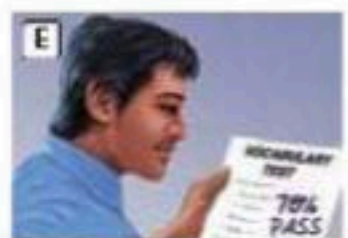
E. Pass a test.