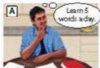
A. Set goals.