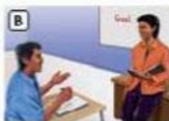
B. Participate in class.