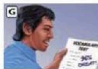
G. Make progress.