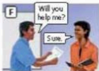
F. Ask for help.