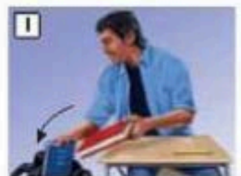
I. Clear off your desk.