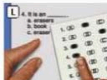
L. Check your work.