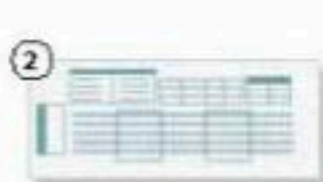
2. answer sheet