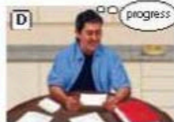
D. Study at home.