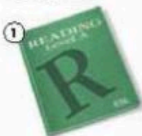
1. test booklet