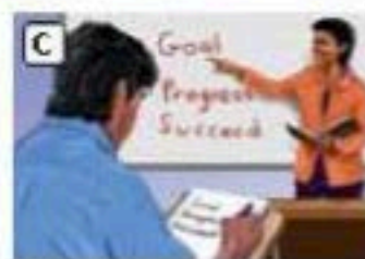
C. Take notes.